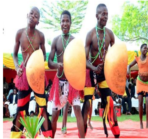
Fig 1.3 Lalakaraka dance of Acoli