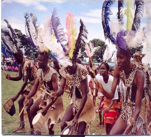
Fig 1.2 Bwola dance of Acoli